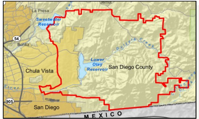
Study area shown in red outline

Your participation in this workshop will provide valuable input on the trail alignments under consideration by this study. Thank you for your participation in the Otay Regional Trail Alignment Study!