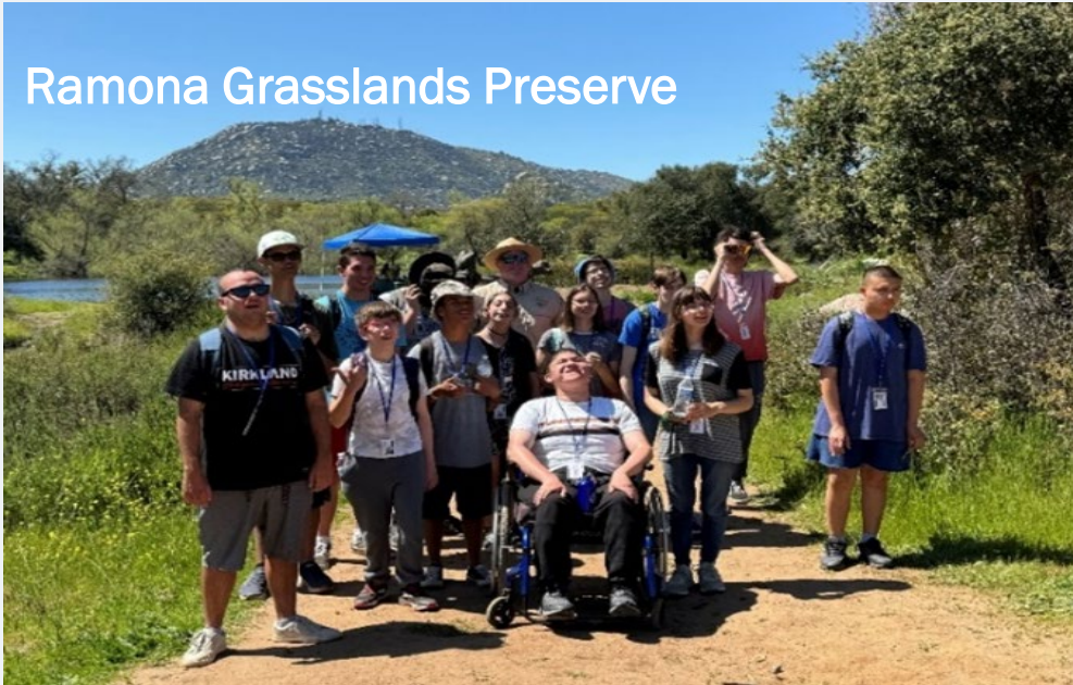
Ramona Grasslands Preserve