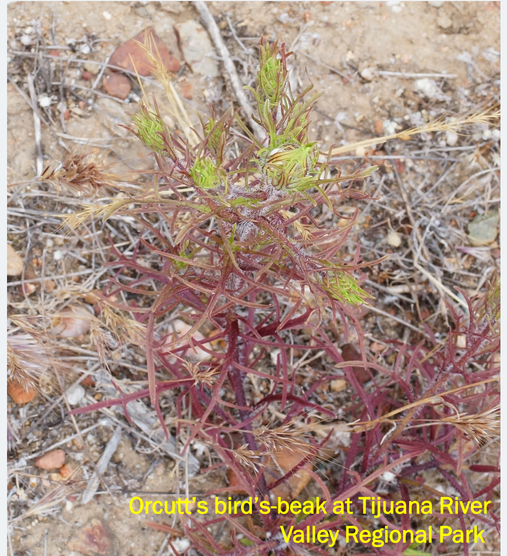
Orcutt's bird's-beak at Tijuana River Valley Regional Park