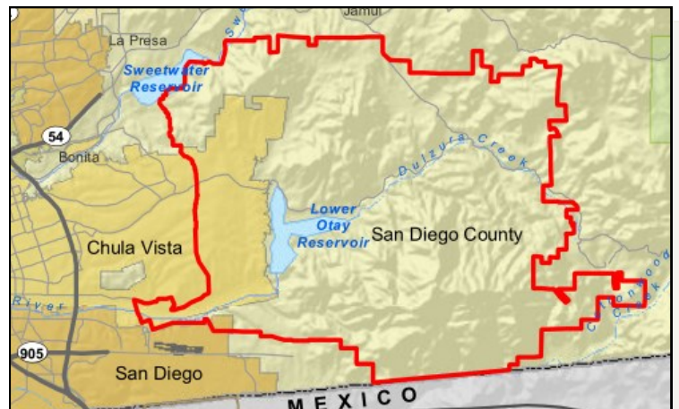
Study area shown in red outline

These lands contain diverse habitats that are home to many sensitive plant and animal species that are considered regionally important. The trail study will consider these and other sensitive resources when designing trail alignments. The trail alignment study will support the design of a sustainable trail system that balances natural resource protection and conservation with public access and recreation. Your input will inform the trail planning process by helping to identify user priorities and preferences for the trail system. Thank you for your participation in the Otay Regional Trail Alignment Study!