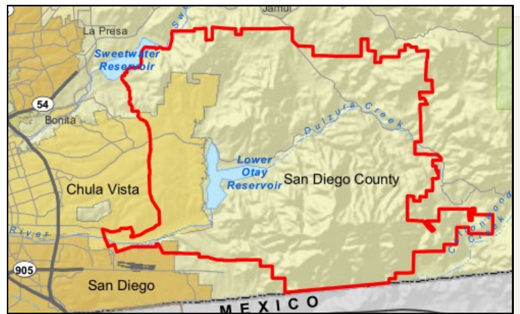
Study area shown in red outline

These lands contain diverse habitats that are home to many sensitive plant and animal species that are considered regionally important. The trail study will consider these and other sensitive resources when designing trail alignments. The trail alignment study will support the design of a sustainable trail system that balances natural resource protection and conservation with public access and recreation. Your input will inform the trail planning process by helping to identify user priorities and preferences for the trail system. Thank you for your participation in the Otay Regional Trail Alignment Study!