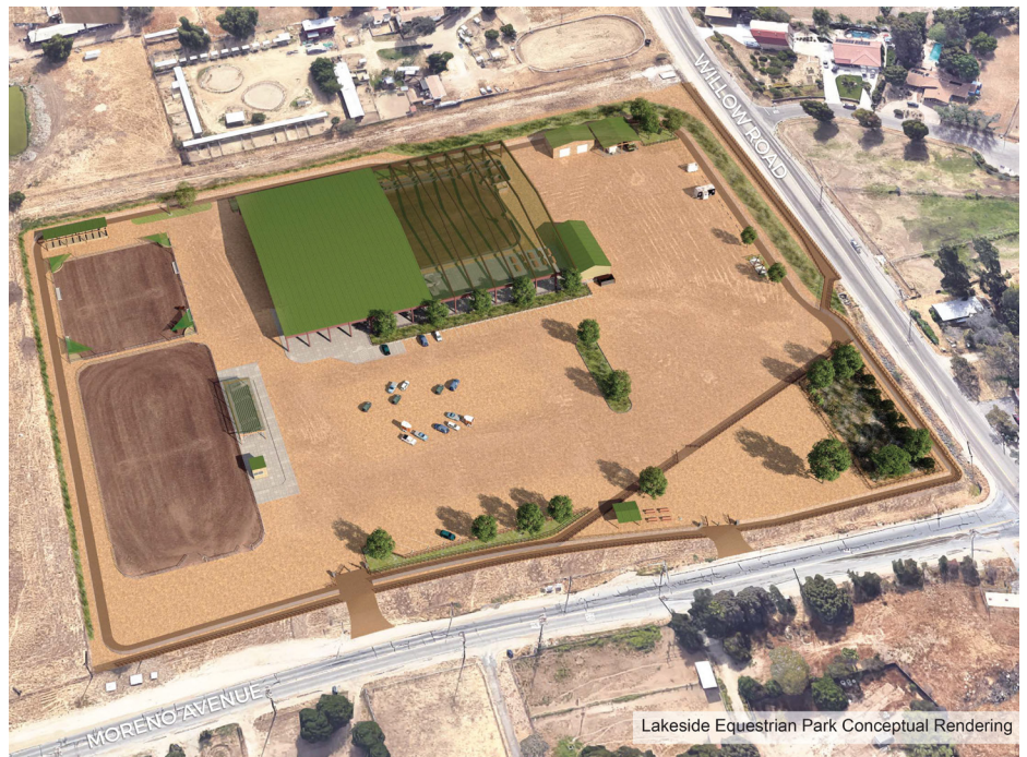
Lakeside Equestrian Park Conceptual Rendering