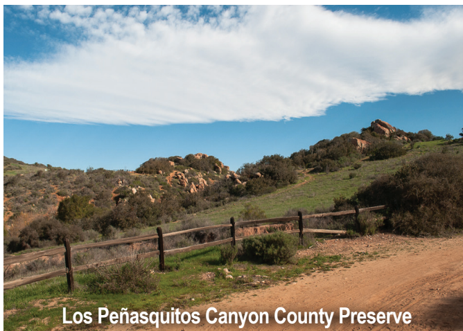
Los Peñasquitos Canyon County Preserve

Los Peñasquitos Canyon County Preserve offers a beautiful year-round ecosystem unlike any other in San Diego County. Trails sit on either side of a bubbling creek feeding a dense grove of riparian plants and trees. Fields of native chaparral sit outside the groves, butting up against suburban development—an oasis frequented by local hikers, cyclists and equestrians. Trail users can take single-track trails near the creek with near constant shade, or venture out to a wider, sunnier trail and access road. Visitors in the spring may see a flowing waterfall at the west end of the preserve where the paths meet.