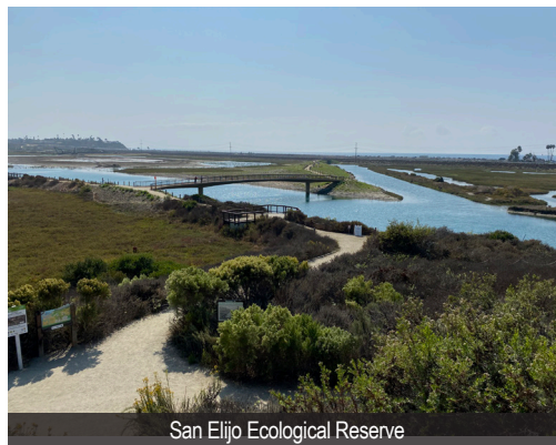
San Elijo Ecological Reserve

SAN DIEGUITO Before Spanish settlers operated the park as a rancharia and place to graze cattle, and the Mexican people built an adobe following their independence from Spain, this land was inhabited by the Kumeyaay people. Located just a few miles from the Pacific Ocean, this approximately 125-acre park has picnic areas, playgrounds, fitness stations, a butterfly garden, sports amenities and 5 miles of trails.