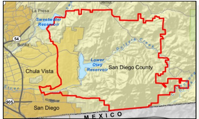
Study area shown in red outline

Your participation in this workshop will provide valuable input on the trail alignments under consideration by this study. Thank you for your participation in the Otay Regional Trail Alignment Study!