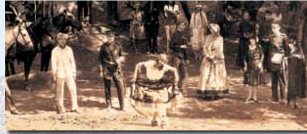
Performance of the Pageant