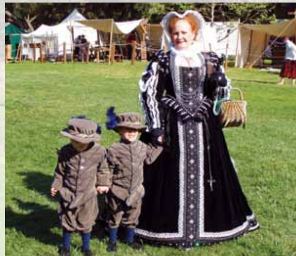
The Renaissance Faire is held twice a year at the park

Visitors can enjoy a variety of outdoor recreational opportunities nestled under the shroud of an old oak grove with numerous picnic sites that can accommodate a single family or host a large event such as a corporate picnic or family reunion.